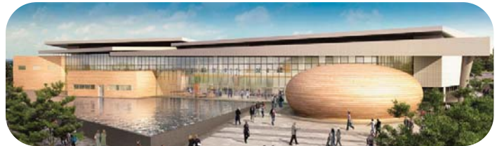
Artists impression of The Nuclear Academy

The Nuclear Academy facility, which is currently under construction, is an iconic building due to open in September 2008. The Nuclear Academy is planned to be a Flagship of the National Skills Academy for Nuclear, upon government approval of the business plan.