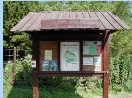
Newtonhill Community Woodland interpretation

Fully signed path network with map boards. Network provides access for walkers throughout, with horse and all ability access at Newtonhill Community Woodland. All facilities within town with all routes no more than a maximum of 45min walk from town centre. Routes cover mixture of sites of historic interest – e.g. Castle of Old Wick, Wick Harbour and Lower Pulteneytown. The old town coup at Newton hill has been transformed into a Community Woodland with a nature interpretive trail, all-ability routes, bridlepath, picnic benches and viewpoint. There is a path leading from the town together with ample parking at the site.