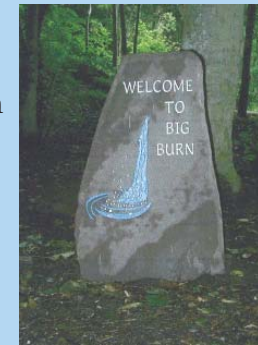
Sign at Big Burn gorge

Huge variety of tracks and trails in this area. For more details see the descriptive routes booklet, ‘Golspie Walks’. All routes accessible from the village as a start point. Walks include the spectacular Big Burn gorge, Ben Bhraggie hill walk, routes through Dunrobin Castle woodlands and coastal links with Brora to the North and Littleferry to the South.