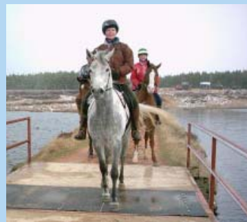
Horsing at Loch More

Forsinain (the peatlands trail). Fully signed route following forestry and estate tracks, crossing some of the wildest and remote countryside in the far North. Suitable for equipped walkers, cyclists and horse riders. There are map boards at strategic locations. The area offers a through route of approx. 16.5 miles or a circular route of the same approximate distance from Loch More.