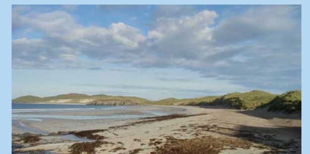
Beach at Durness

A visit to the far North West is well worth the effort with miles of deserted beaches, moorlands and even a dramatic cave to explore. The adventurous walker is well catered for with an abundance of routes through this enchanted landscape of sweeping bays, rugged cliffs, crofting settlements and moorland. Most facilities are in Durness, with sign posted routes and an accompanying trails booklet which you can find in the local tourist information office.