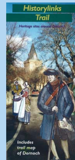
Historylinks Trail Leaflet