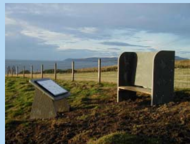
Old coastal lookout

The coastal route provides the option of visiting the historical Brethren Well or the old coastguard lookout, shelter bench and “seawatching” interpretive panel from the harbour. Route suitable for walkers only.